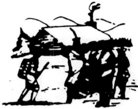
Oneidas bringing several hundred bags of corn to Washington's starving army at Valley Forge after the colonists had consistently refused to aid them