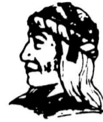
UGWA DEMOLUM YATEHE Because of the help of this Oneida Chief in cementing a friendship between the six nations and the Colony of Pennsylvania a new nation the United States was made possible