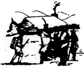
Oneidas bringing several hundred bags of corn to Washington's starving army at Valley Forge after the colonists had consistently refused to aid them.