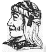
UGHWA DEHLOH YATER Because of the help of this Oneida Chief in cementing a friendship between the six nations and the Colony of Pennsylvania, a new nation, the United States was made possible.