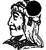
UGWA DEHLUN YATENE

Because of the help of this Oneida Chief in cementing a friendship between the six nations and the Colony of Pennsylvania, a new nation, the United States was made possible.