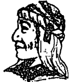
UGWA DENDLUN TATENE

Because of the help of this Oneida Chief in cementing a friendship between the six nations and the Colony of Pennsylvania, a new nation, the United States was made possible.