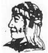
UGWA DEMOLUM YATEHE Because of the help of this Oneida Chief in cementing a friendship between the six nations and the Colony of Pennsylvania, a new nation, the United States, was