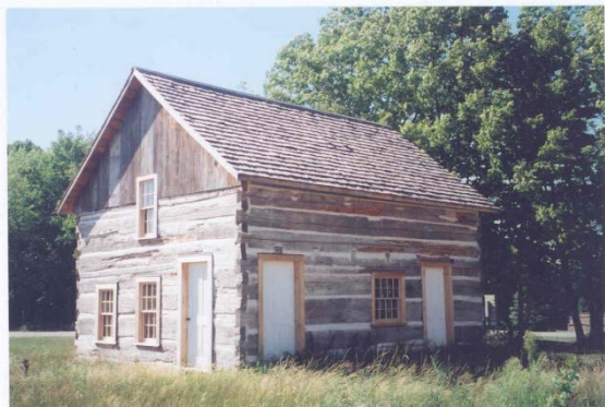
JOHN Q. ADAMS HOUSE Dexter Drive

This house was also known as the Dexter House. It was removed from Dexter Drive which used to cross Duck Creek and continue on to County Highway J at the time the house was built. It was located behind the Hidden Valley Driving Range near Duck Creek just off Highway 54 in Oneida, Wisconsin. The house is believed to have been built around the mid-1800's.