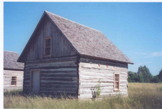
THE ELIJAH E. SKENANDORE HOUSE 600 Silas Drive

The cabins first floor ceiling was a matched beaded board with several layers of paint. The second floor ceiling was 4x8 sheets of paperboard with one layer of paint. 1