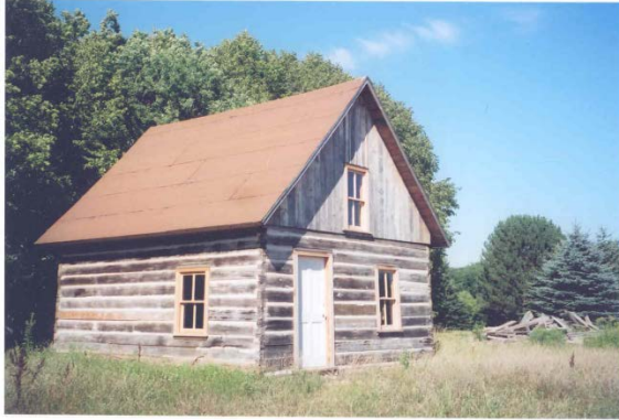
CHAUNCEY BAIRD HOUSE 144 Shenandoah Drive