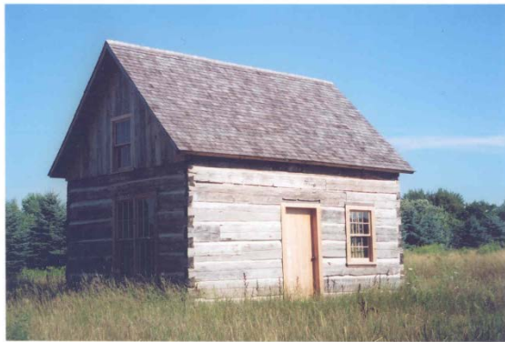
THE JACOB SHENANDOAH HOUSE 140 Shenandoah Street

While inspecting the structure, it was noted that the center core of the dwelling was actually a two story log cabin that had been covered over inside and out with conventional frame addition being added on later to the east and west ends of the original structure. Further inspection indicated that the original logs appeared to be in good condition. It was believed that this structure was the original Elijah Skenandore home since it was located on his original allotment and the way the logs were assembled.