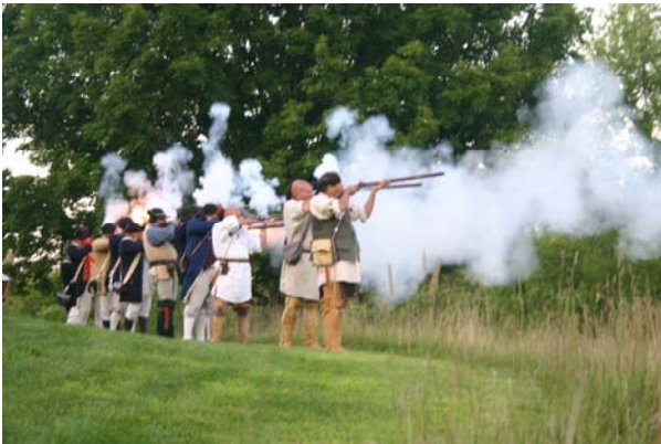
Image 2: August 6 th , 2009, re-enactors dressed in time period clothing fire three musket shots in commemoration of those that perished during the Battle of Oriskany on August 6 th , 1777.

During the battle, it is believed that more than 30 Oneida Warriors sacrificed their lives and more than 500 colonial troops died. General Herkimer was injured but requested to be propped up against a tree and continued to shout out battle orders for the duration of the fight. There was no clear victor in the battle. The British were unsuccessful in obtaining control of the portage, the Americans suffered heavy casualties, and the native allies lost large numbers of already depleted warrior base. Unable to linger in the area, the bodies of the soldiers lay on the battlefield for years and many were never properly buried.