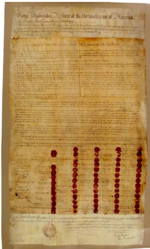
Figure 1: The 1794 Treaty of Canandaigua which is housed at the National Archives in Washington DC. Two pieces of cloth were attached to the document, one signed by George Washington making it law.