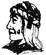
UGWA DEMOLUM YATEHE Because of the help of this Oneida Chief in cementing a friendship between the six nations and the Colony of Pennsylvania, a new nation, the United States was made possible