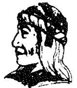
UGWA DEMOLUM YATEHE Because of the help of this Oneida Chief in cementing a friendship between the six nations and the Colony of Pennsylvania, a new nation, the United States was made possible