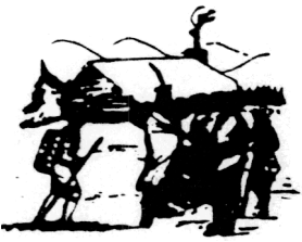
Oneidas bringing several hundred bags of corn to Washington's starving army at Valley Forge after the colonists had consistently refused to aid them