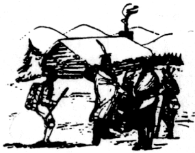
Onondas bringing several hundred bags of corn to Washington's starving army at Valley Forge, after the colonists had consistently refused to aid them.