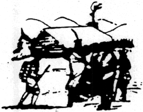
Oneidas bringing several hundred bags of corn to Washington's starving army at Valley Forge after the colonists had consistently refused to aid them