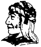
UGWA DEMOLUM YATEHI Because of the help of the Oneida Chief in cementing a friendship between the six nations and the Colon of Pennsylvania, a new nation for the United States was made possible