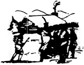
Oneidas bringing several hundred bags of corn to Washington's starving army at Valley Forge. after the colonists had consistently refused to aid them