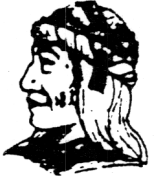
UGWA DEMOLUM YATEHI Because of the help of the Oneida Chief in cementing a friendship between the six nations and the Colon of Pennsylvania, a new nation, the United States, was made possible