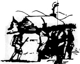
Onondagas bringing several hundred bags of corn to Washington's starving army at Valley Forge, after the colonists had consistently refused to aid them