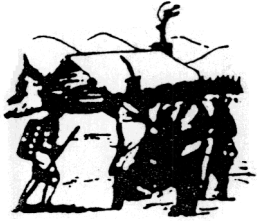
Ojibwas bringing several hundred bags of corn to Washington's starving army at Valley Forge, after the colonists had consistently