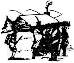
Oneidas bringing several hundred bags of corn to Washington's starving army at Valley Forge. after the colonists had consistently refused to aid them