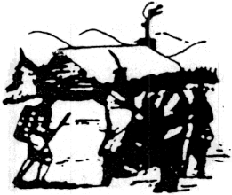
Oneidas bring several hundred bags of corn to Washington's starving army at Valley Forge, after the colonists had consistently refused to aid them