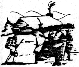
Oneidas bringing several hundred bags of corn to Washington's starving army at Valley Forge after the refused to aid them