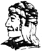
UGWA DEMOLUM YATEHE Because of the help of this Oneida Chief in cementing a friendship between the six nations and the Colony of Pennsylvania a new nation: the United States was