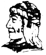
UGWA DEMOLUM KATEHE Because of the help of the Oneida Chief in cementing a friendship between the Six Nations and the Colonists of Pennsylvania a new nation for the United States was made possible.