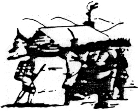
Oneidas bringing several hundred bags of corn to Washington's starving army at Valley Forge after the colonists had consistently refused to aid them.