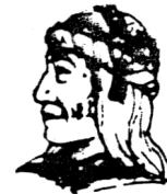
UGWA DEMOLUM YATEHE Because of the help of this Oneida Chief in cementing a friendship between the six nations and the Colony of Pennsylvania, a new nation, the United States was