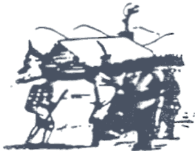
Oneidas bringing several hundred bags of corn to Washington's starving army at Valley Forge after the colonists had consistently