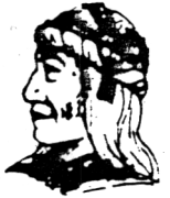
UGWA DEMOLUM YATEHE Because of the help of this Oneida Chief in cementing a friendship between the six nations and the Colony of Pennsylvania, a new nation, the United States was made possible