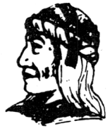
UGWA DEMOLUM YATEHE Because of the help of this Oneida Chief in cementing a friendship between the six nations and the Colony of Pennsylvania, a new nation, the United States, was