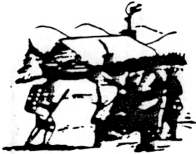
Oneidas bringing several hundred bags of corn to Washington's starving army at Valley Forge after the colonists had consistently refused to aid them