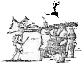
Oneidas bringing several hundred bags of corn to Washington's starving army at Valley Forge, after the colonists had consistently refused to aid them.