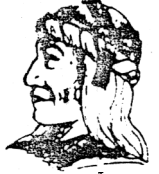
UGWA DENOLUH YATEHE Because of the help of this Oneida Chief in cementing a friendship between the six nations and the Colony of Pennsylvania, a new nation, the United States was made possible.