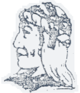
UGWA OINOLUM YATENE

Because of the help of this Oneida Chief in cementing a friendship between the six nations and the Colonies of Pennsylvania, a new nation, the United States was made possible.