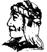
UGWA DEMOLUN YATENE