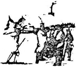
Onondagas bringing several hundred bags of corn to Washington's starving army at Valley Forge, after the colonists had consistently refused to aid them