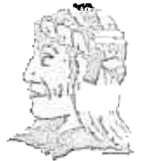
USWA DINOLUH TATINE Because of the help of this Oneida Chief in cementing a friendship between the six nations and the Colony of Pennsylvania, a new nation, the United States was made possible.