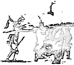
Onondagas bringing several hundred bags of corn to Washington's starving army at Valley Forge, after the colonists had consistently refused to aid them.