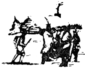
Onondagas bringing several hundred bags of corn to Washington's starving army at Valley Forge, after the colonists had consistently refused to aid them.