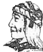
UGWA DEMOLUH YATENE

Because of the help of this Oneida Chief in cementing a friendship between the six nations and the Colony of Pennsylvania, a new nation, the United States was made possible.