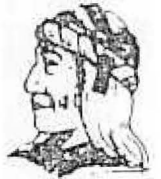
UGHWA GENOLUH TATENE

Because of the help of this Oneida Chief in cementing a friendship between the six nations and the Colony of Pennsylvania, a new nation, the United States was made possible.