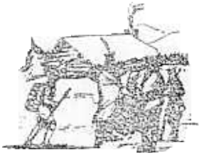
Onoias bringing several hundred bags of corn to Washington's starving army at Valley Forge, after the colonists had consistently refused to aid them.