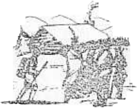
Oneidas bringing several hundred bags of corn to Washington's starving army at Valley Forge, after the colonists had consistently refused to aid them.