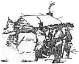
Onondagas bringing several hundred bags of corn to Washington's starving army at Valley Forge, after the colonists had consistently refused to aid them.