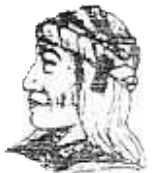
UGWA DEHOLUN YATENE

Because of the help of this Oneida Chief in cementing a friendship between the six nations and the Colony of Pennsylvania, a new nation, the United States was made possible.