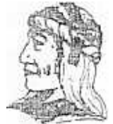
OJWA DENOLUN TATEKE

Oneidas bringing several hundred bags of corn to Washington's starving army at Valley Forge, after the colonists had consistently refused to aid them.