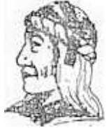
UGWA DEHOLUH YATEHE

Because of the help of this Oneida Chief in cementing a friendship between the six nations and the Colony of Pennsylvania, a new nation, the United States was made possible.