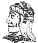
UGWA DEHOLUN TATENE Because of the help of this Oneida Chief in cementing a friendship between the six nations and the Colony of Pennsylvania, a new nation, the United States was made possible.