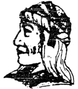
UGWA DEHOLUH YATEHE