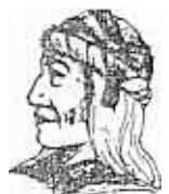
UGWA DEMOLUX YATEHE Because of the help of this Oneida Chief in cementing a friendship between the six nations and the Colony of Pennsylvania, a new nation, the United States was made possible.