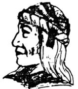
UGWA DEMOLUN YATEHE

Approved As Read Regular Meeting August 2, 1982