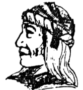
UGWA BEHOLUH YATENE