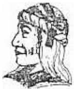
UGWA DEHOLUH YATEHE Because of the help of this Oneida Chief in cementing a friendship between the six nations and the Colony of Pennsylvania, a new nation, the United States was made possible.