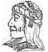
UGWA DEHOLUH YATEHE Because of the help of this Oneida Chief in cementing a friendship between the six nations and the Colony of Pennsylvania, a new nation, the United States was made possible.