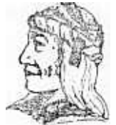
UGWA DEHOLUH YATEHE Because of the help of this Oneida Chief in cementing a friendship between the six nations and the Colony of Pennsylvania, a new nation, the United States was made possible.