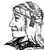
UGWA DEHOLUH YATEHE Because of the help of this Oneida Chief in cementing a friendship between the six nations and the Colony of Pennsylvania, a new nation, the United States was made possible.