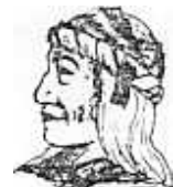
UGWA DEHOLON YATEHE Because of the help of this Oneida Chief in cementing a friendship between the six nations and the Colony of Pennsylvania, a new nation, the United States was made possible.