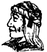
UGWA DENOLUM VAPONE

Because of the of this Oneida of in cementing a friendship between the six nations and the Colony of Pennsylvania, a new nation, the United States was made possible.