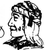
UGWA DEHOLUN YATENE

Because of the help of this Oneida Chief in cementing a friendship between the six nations and the Colony of Pennsylvania, a new nation, the United States was made possible.