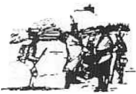
Onidas bringing several hundred bags of corn to Washington's starving army at Valley Forge, after the colonists had consistently refused to aid them.