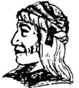
UGWA DEHOLUH YATEHE Because of the help of this Oneida Chief in cementing a friendship between the six nations and the Colony of Pennsylvania, a new nation, the United States was made possible.