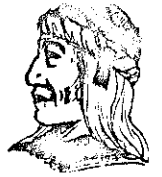
UGWA DEMOLUH YATERE

Because of the help of this Oneida Chief in cementing a friendship between the six nations and the Colony of Pennsylvania, a new nation, the United States was made possible.